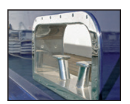
Stainless steel bracket in aluminium shell plate

TIKAL TEF-GEL® is a watertight, PTFE-based paste which prevents the blooming of metal and also reliably prevents corrosion from galvanic flows between unequal metals. In all places where refined metals come into contact with less refined metals (eg. aluminium with stainless steel), a small amount of TIKAL TEF-GEL® suffices to prevent galvanic exchange of electrons and subsequent corrosion.