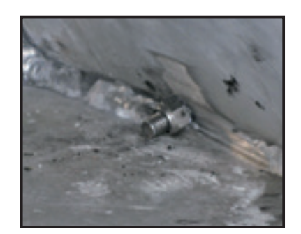
Stainless steel in aluminium welded seam