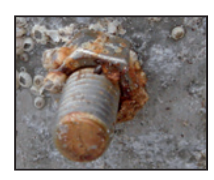
Corroded VA screw in aluminium