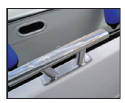
Stainless steel coating on aluminium hull