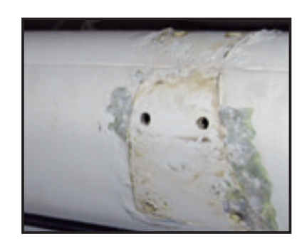
Corroded aluminium mast