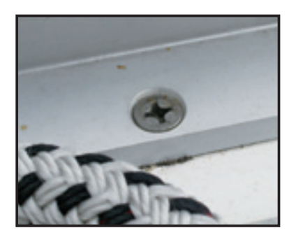
Stainless steel screw aluminium floor rail